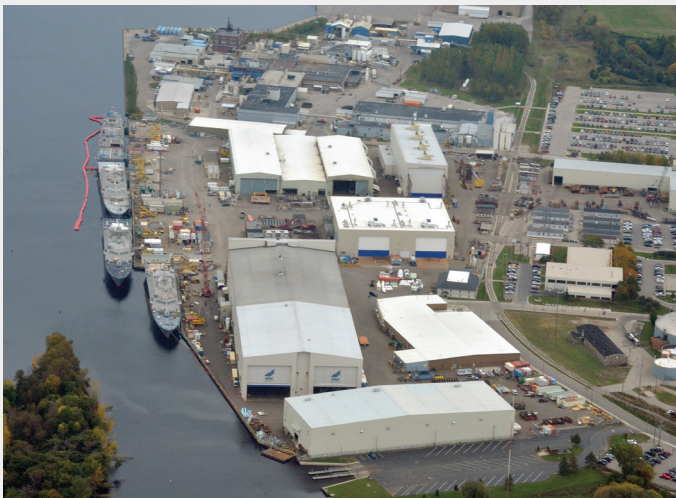
Fincantieri Marinette Marine, Wisconsin

We will list our Australian business, Fincantieri Australia, on the Australian Stock Exchange if selected for SEA 5000. We are invested in Australia and committed to long-term success. Fincantieri Australia will have Australian investors, Australian management and Australian workers and be headquartered in Adelaide.