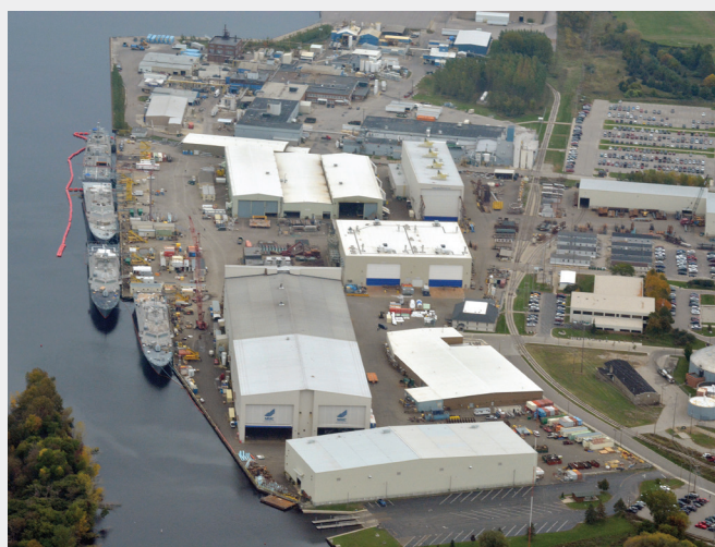
Fincantieri Marinette Marine, Wisconsin