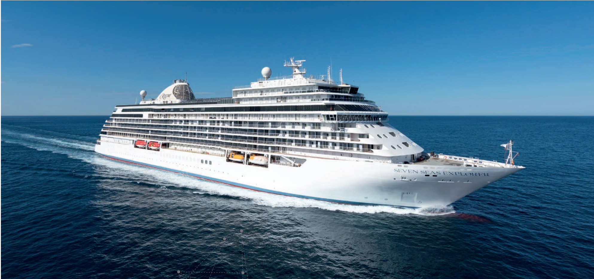
Seven Seas Explorer