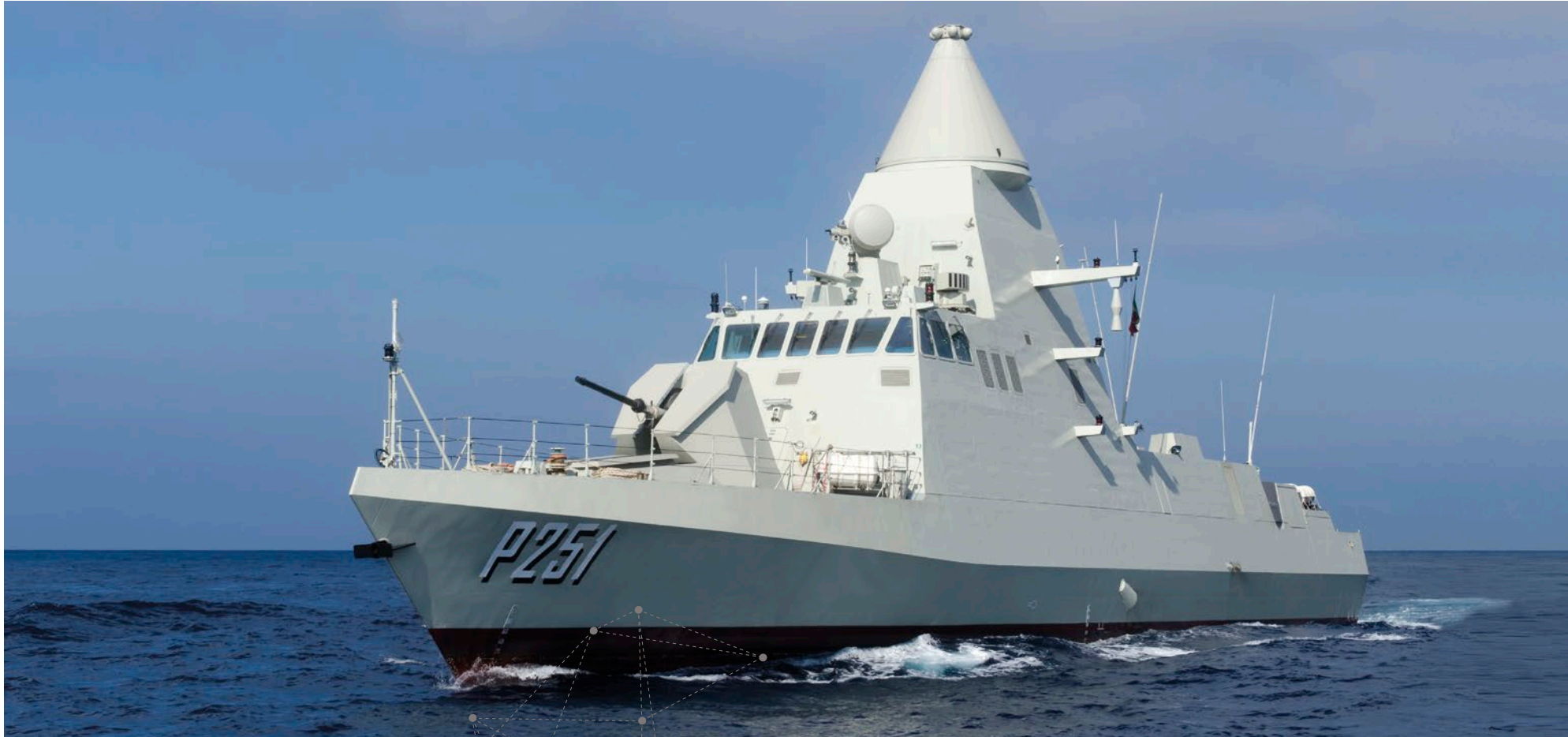
Stealth Attack Craft Falaj 2 Class